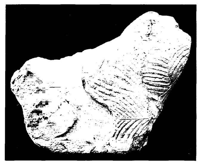
MOZAN, TELL. Figure 3. Small statue of a lion found in temple BA.

Typical Early Dynastic III ceramics include medium jars with grooved rims, Simple-ware conical cups, and Metallic-ware jars with rounded or ring bases. Akkadian ceramics are characterized by a later variety of metallic ware and a con-